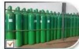
1. Cylinder Surface Inspection & treatment